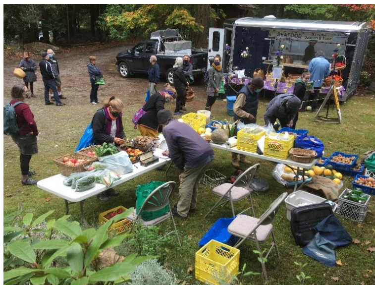
8 th Annual Stock Up Market

In 2021, the Food Program began a collaboration with a new Southern Gulf Islands food and agriculture collective called the Food Resilience Alliance (FRA) that works to address food-related gaps and opportunities at a regional level. The FRA was successful in securing a Community Works Fund grant in Spring 2021 and funded a wide range of projects.