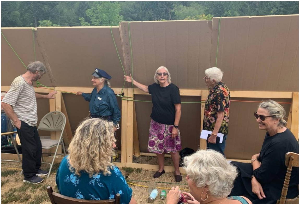
Behind the Scenes