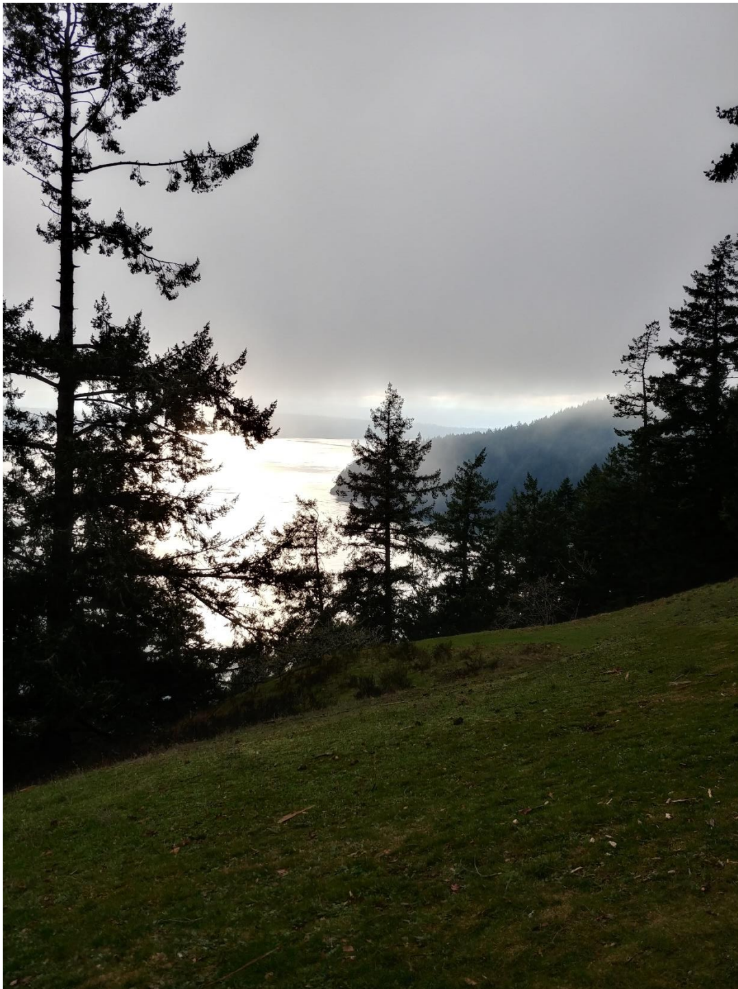
Looking toward Mt Galiano and Collinson Point from The Bluffs